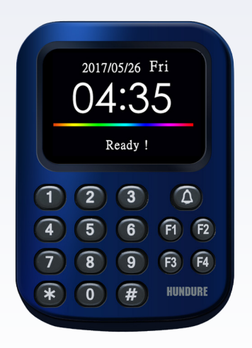
Optional background image